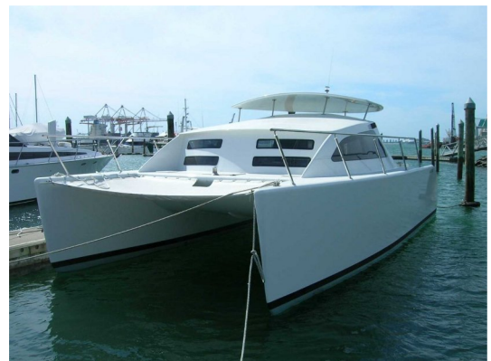
KSS P33 KaivitiKat

While working with liquid resins, does it make more sense to work on boat shapes or to do 95% of the work on a flat table, from which a smooth finish to one side is free, letting vacuum pressure do the hard work, to achieve the best standards? Everything in KSS follows from there.