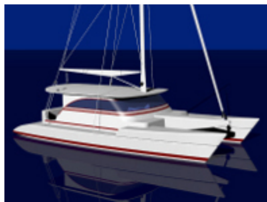
KSS 42 Kittiwake

A number of new designs are available for Modular Assembly, both power and sail and more being added. Ships, houses and other items benefit from the approach. Catamarans lend themselves to modular assembly, with further major build time savings at every stage. Large, multilevel catamarans can slash build time this way.