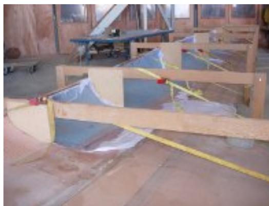
Frames for half hull shaping

Today, we have two approaches to hull shaping. One-step and half hull shaping. Either can apply for most designs, depending on circumstances. The one step process, which came first, uses the same panels but with a set of frames to control the deck width and the keel depth, with the center plane of the hull vertical.