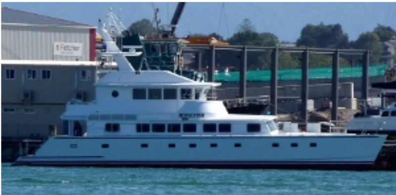
Bonefish a KSS 82

It is rarely possible to get a true comparison. However, our conservative claim is to at least halve the time to produce the shell. Choose to spend a year of boring, dusty, health threatening, torture boarding and painting, or slash that time with KSS?