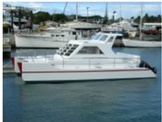
KSS P36ma Outboard Powered