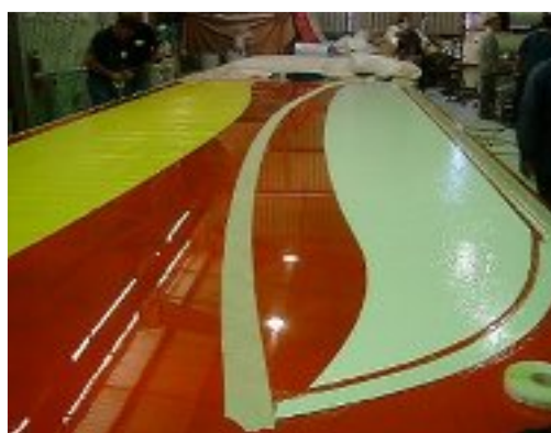
Table and Resin Infusion

The hulls are no compromise shapes, whether for high performance sailing, strictly cruising or power. Without compromise, KSS achieves all the catamaran shapes we could ever need as designers.