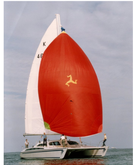
Legs of Mann IV

The materials are composite skins (glass and polyester or vinylester resin) on PVC foam core. Epoxy can be substituted but adds cost and toxicity. No other core material has the ideal properties, the durability and the tremendous versatility of PVC Foam. PVC foam is described as the 'Gold Standard' on the second hand market. The common core alternatives being endorsed by a surprising number of designers do not match foam on any count, particularly on durability or versatility.