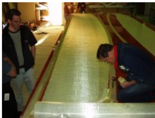
Setting out on the table

To produce a compound shape from flat requires either the removal of some material or the stretching or compressing of the material. KSS hull shaping involves both to some extent. The dart cuts are the means of removing material and pressure stretches or compresses the foam. The secret is in the make up of the panels and the set up to control the shaping process.