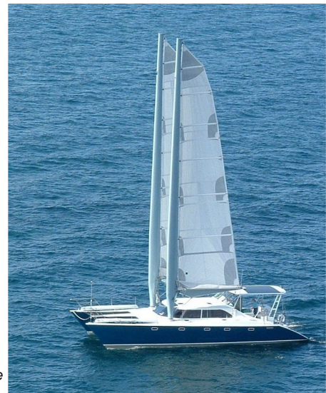
KSS 54 Coolchange

KSS efficiency, compared to the usual alternative, cuts the build time by at least half.